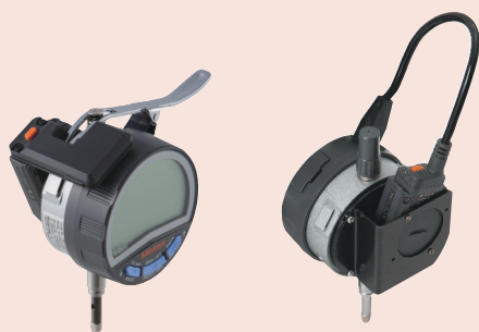
02AZF700 and Indicator