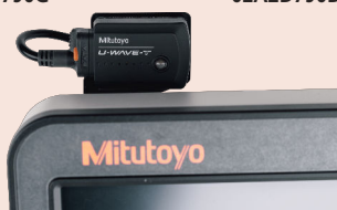
12AAY486 U-WAVE-T 02AZG011