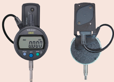
02AZE200 U-WAVE-T 02AZD790F