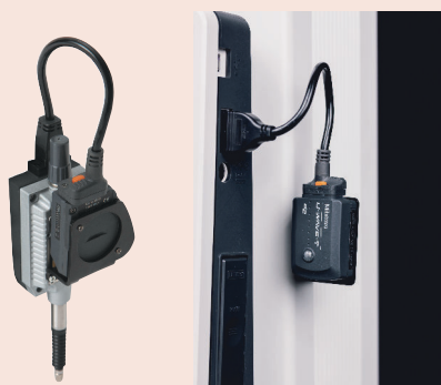
02AZF675 U-WAVE-TM 02AZD790G